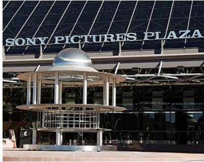
Sony Pictures Studios (10 minutes from our home)