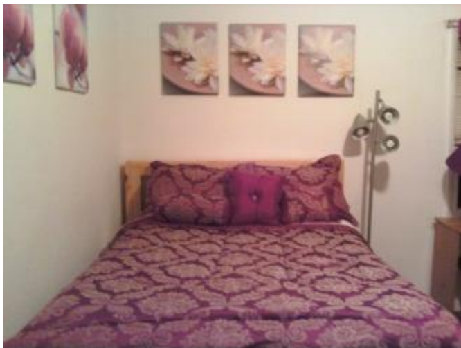
Guest Room Two