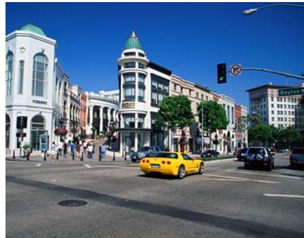
Beverly Hills (7 minutes from