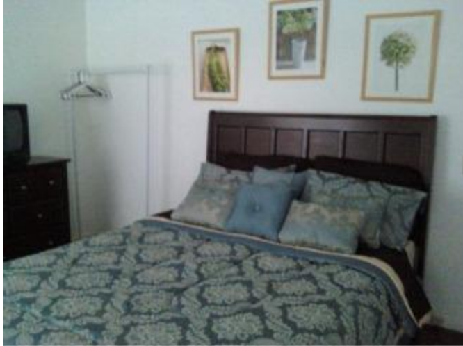
Guest Room Three