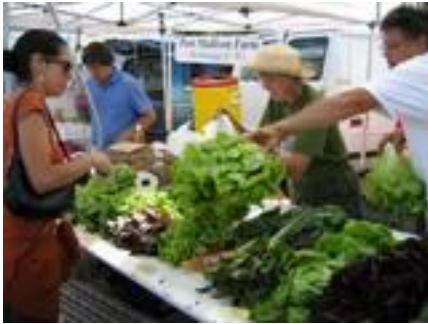
The Farmers Market in Hollywood (10 minutes from our