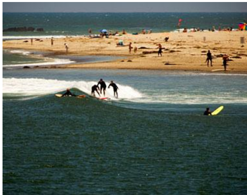
Malibu Beach (20 minutes from our home)