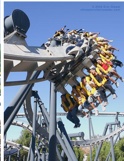
Six Flags Magic Mountain (30 minutes from our home)