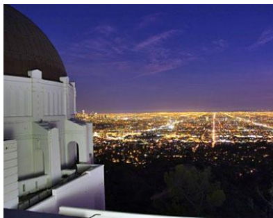
Griffith Park Observatory (20 minutes from our home)