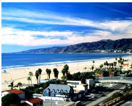
Santa Monica Beach (10 minutes from our home)