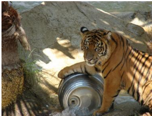
The Los Angeles Zoo (20 minutes from our home)