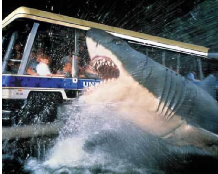
Universal Studios Hollywood (20 minutes from our home)