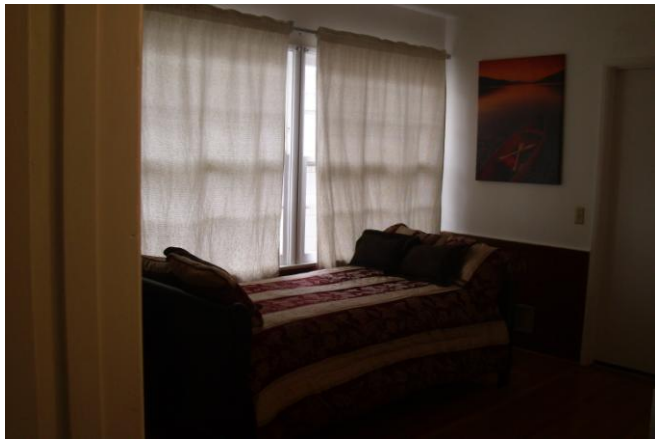
Guest Room One