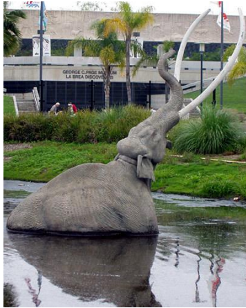
La Brea Tar Pits (15 minutes from our home)